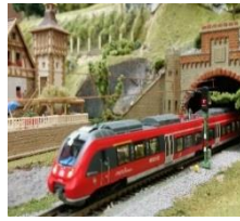
Rheinland- Bayern Bahn