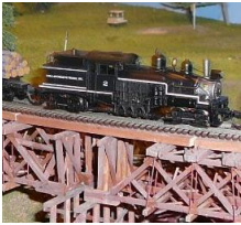
Pikes Peak "N" Gineers