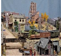
Slim Rail w/Fremont Display